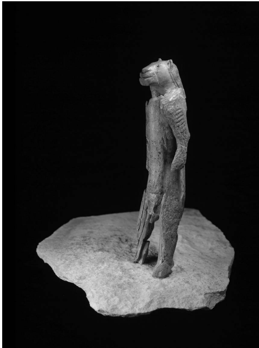
Figure 3. Hohlenstein-Stadel figurine, ca. 32,000 years old. A color version of this figure is available in the online edition of Current Anthropology .

then Neanderthals would have possessed it as well. However, lacking the parietal expansion that characterizes Homo sapiens (Neanderthals show a widening of the upper parietal region but lack the enlargement of the anteroposterior region of the parietal lobes; Bruner, Manzi, and Arsuaga 2003), Neanderthals might have lacked the higher-level symbolic capabilities associated with the IPS. According to the work by Orban et al. (2006), this might imply that Neanderthals lacked some ability with regard to the finely detailed visual representation of “moving objects with moving parts” and hence sophisticated tool handling and fabrication (Orban et al. 2006:2664). This purported lack of ability in Neanderthals is perhaps reflected in their spears, more often designed to be thrust rather than thrown great distances (e.g., Trinkhaus 1995).